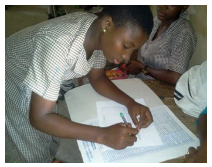
A Nigerian student enters her name in the LLIN register before she receives a net at her school in Cross River state. (2013)