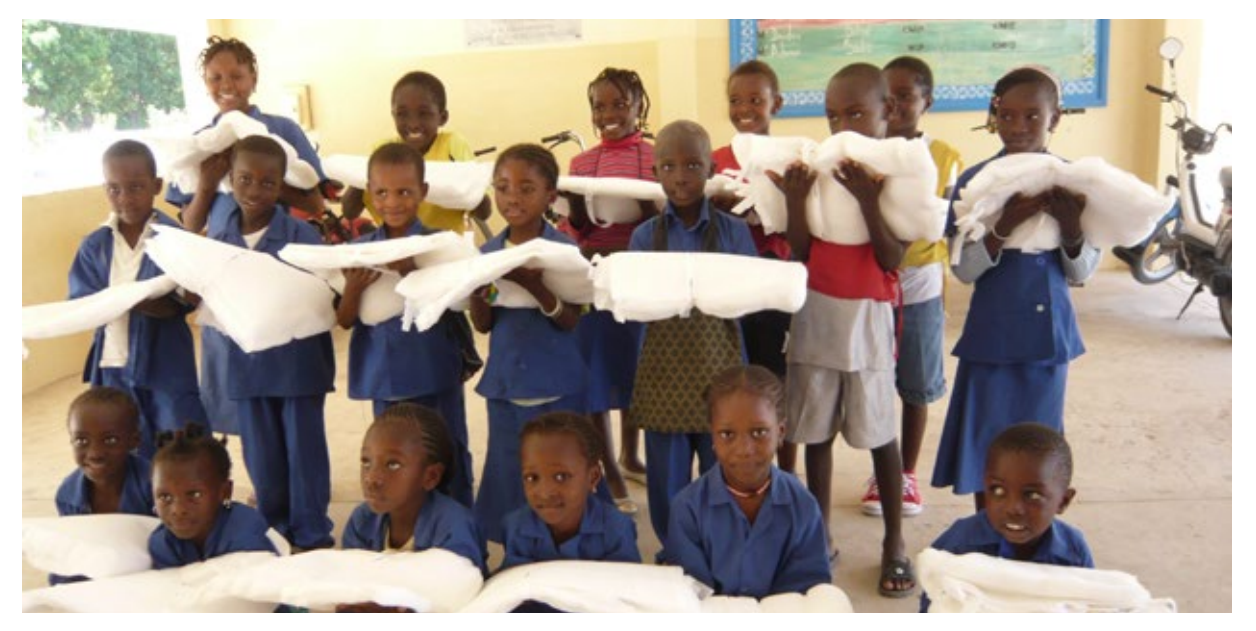
Pupils in a classroom in Ziguinchor, Senegal, display the LLINs they have received at school. (2013)