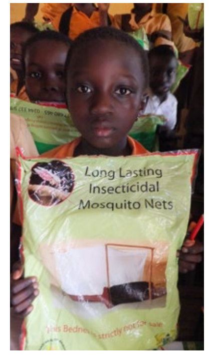
A pupil in Ghana holds the LLIN he received in school that day. (2014)