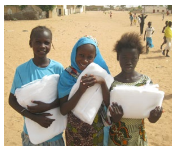
Three schoolgirls receive LLINs in Linguere, Senegal. (2013)

Students are an easily defined target group and the size of the target group can be tailored in line with needs for distribution numbers (by increasing or decreasing the number of classes targeted dependent on data regarding LLIN ownership coverage). In many countries, provided enrollment rates are sufficiently high, selecting several classes can result in a fairly large target group. This results in a greater number of LLINs being delivered than is possible through other common continuous distribution channels such as antenatal care (ANC) and Expanded Programme on Immunization (EPI) clinics,