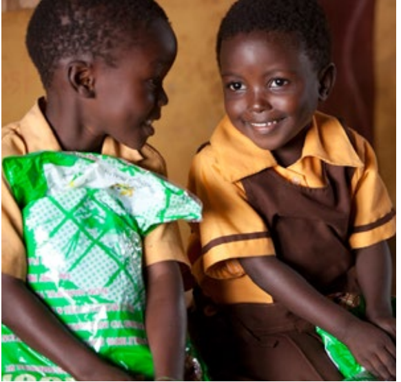
Pupils in primary class two who have just received LLINs at their school in Ghana. (2014)

Transport and handling of reverse logistics should be planned for from the outset, and these plans clearly communicated to all involved. Appropriate management of surplus LLINs following school based distribution has been identified as an important aspect to improve accountability of this distribution mechanism. A form should be