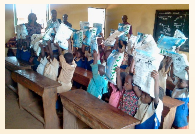
Nigerian students receive nets to take home. School-based distribution of LLINs can be a feasible and effective way to sustain coverage after campaigns.

The school LLIN distribution pilot in Cross Rivers State was innovative in its simplicity. Much of the necessary logistics were already in place and the education sector was a highly motivated partner. In the first round of the pilot, eighty-eight public schools distributed 8,444 nets to students and teachers in Obubra LGA (population 185,000).