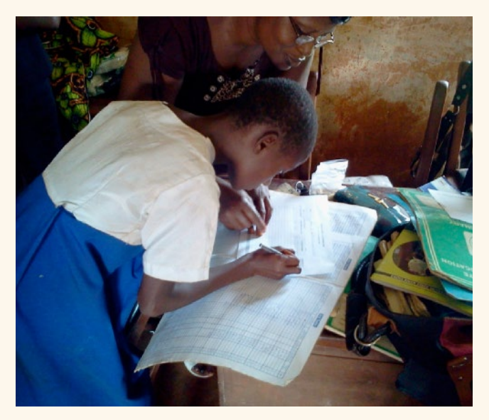
A student signs her name in the distribution register after receiving a net in school.

Planners used second term attendance numbers from school records to calculate the number of nets required. The second term was chosen because attendance usually stabilizes by this time in the school year. The exact number of nets was allocated by the state using leftover nets from the recently completed mass campaign. A buffer stock was considered unnecessary. If any beneficiaries claimed that they should have received a net but did not, the school reviewed their attendance records to ensure that the students were indeed eligible (and did not return to school simply to obtain a net). Missed beneficiaries were scheduled to receive nets in the following year even if they had moved on to the next grade.