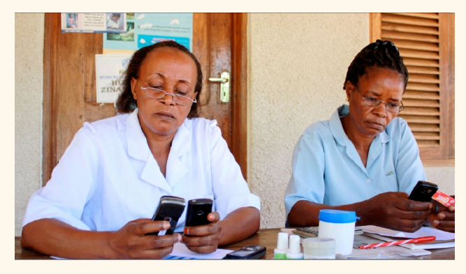
Figure 3 - Issuing the "eVoucher"

When a clinic worker wants to issue a voucher to a pregnant woman (or caregiver of an infant), the number is generated randomly by a central server when an SMS request is sent through their handset. All SMSs sent to the server are at no cost to the clinic worker and reverse-charged to MEDA, similar to dialing a toll-free number.