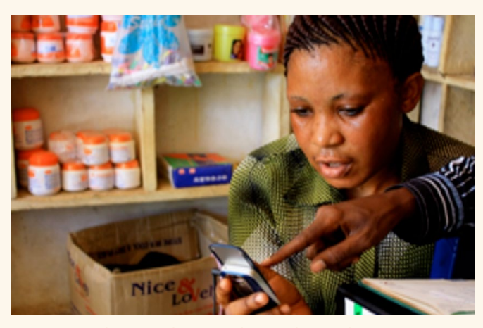
Figure 4 - redeeming the "eVoucher" at the retailer

Market Transaction Factors - The supply chain is the set of all market transactions that begin with production and end with the final consumer.