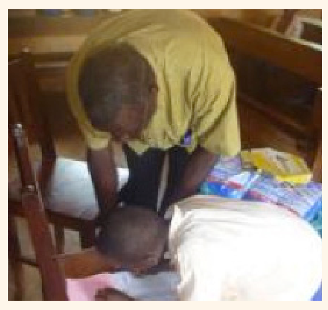
A child in P3 signs for his net

Attendance in school was very high on the days of issuing nets in the three regions, and the children were excited. Children rarely get something new for themselves, and many kids expressed great joy that they were getting a brand new net. Children in the nontargeted classes were disappointed that they would not receive nets. The strategy of encouraging redistribution of nets to needy households was a challenge—most head teachers said that children would not share nets with other households, but perhaps within their families. Schools needed only a half-day to complete distribution in all the classes.