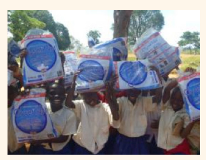
Schoolchildren after net distribution in Ruvuma

Class teachers, supervised by health and head teachers, registered eligible school children. Eligible school children were those in Standard 1, 3, 5 and 7 and Forms 2 and 4. This exercise was successfully completed in all primary and secondary schools where a total of 437,930 eligible school children were registered.