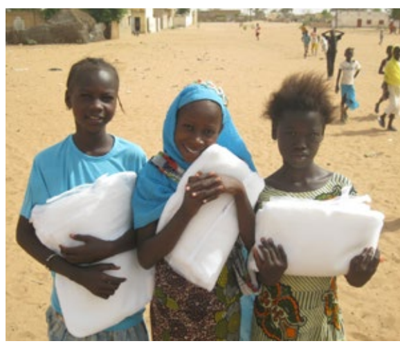
Three schoolgirls receive LLINs in Linguere, Senegal. (2013)

1. Students are an easily defined target group and the size of the target group can be tailored in line with needs for distribution numbers (by increasing or decreasing the number of classes targeted dependent on data regarding LLIN ownership coverage). In many countries, provided enrollment rates are sufficiently high, selecting several classes can result in a fairly large target group. This results in a greater number of LLINs being delivered than is possible through other common continuous distribution channels such as antenatal care (ANC) and Expanded Programme on Immunization (EPI) clinics,