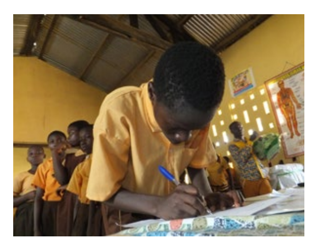
A student in Ghana signs the classroom LLIN register to receive an LLIN (2014).