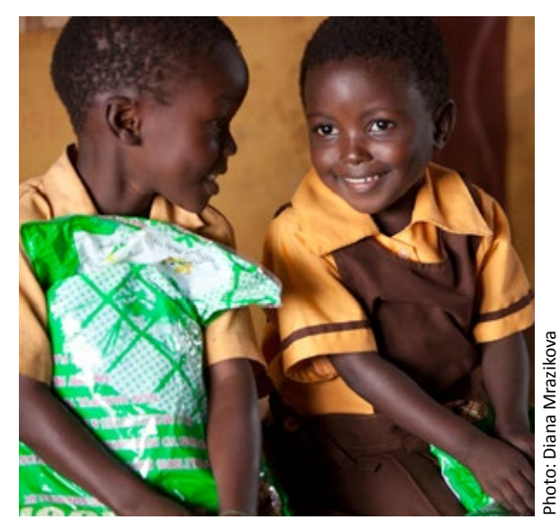
Pupils in primary class two who have just received LLINs at their school in Ghana. (2014)

Transport and handling of reverse logistics should be planned for from the outset, and these plans clearly communicated to all involved. Appropriate management of surplus LLINs following school based distribution has been identified as an important aspect to improve accountability of this distribution mechanism. A form should be