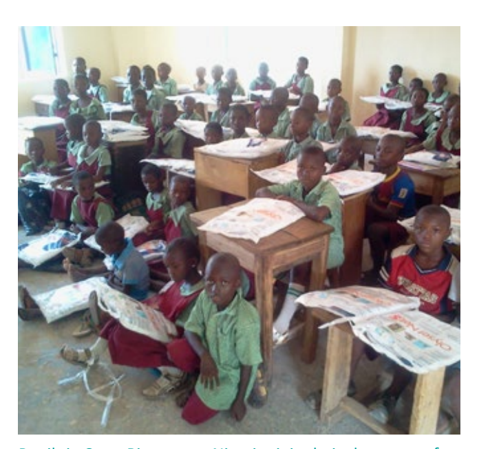
Pupils in Cross River state, Nigeria sit in their classroom after having received LLINs to take home with them. (2013)

Evaluation: A final evaluation will take place after the third round of the pilot in 2014.