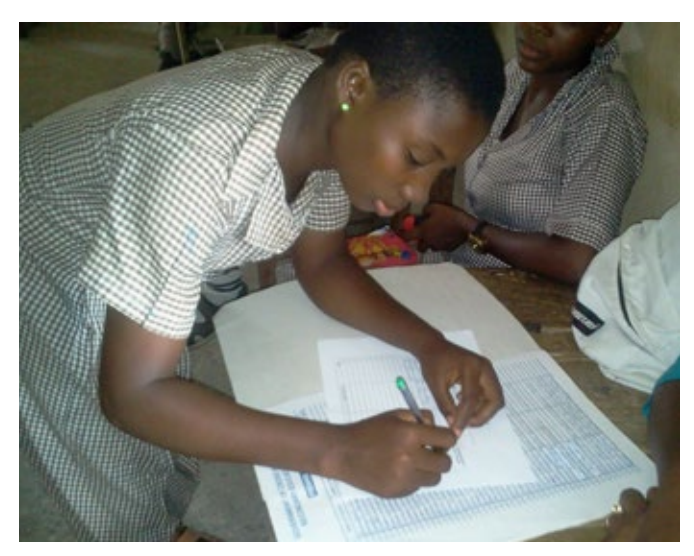
A Nigerian student enters her name in the LLIN register before she receives a net at her school in Cross River state. (2013)