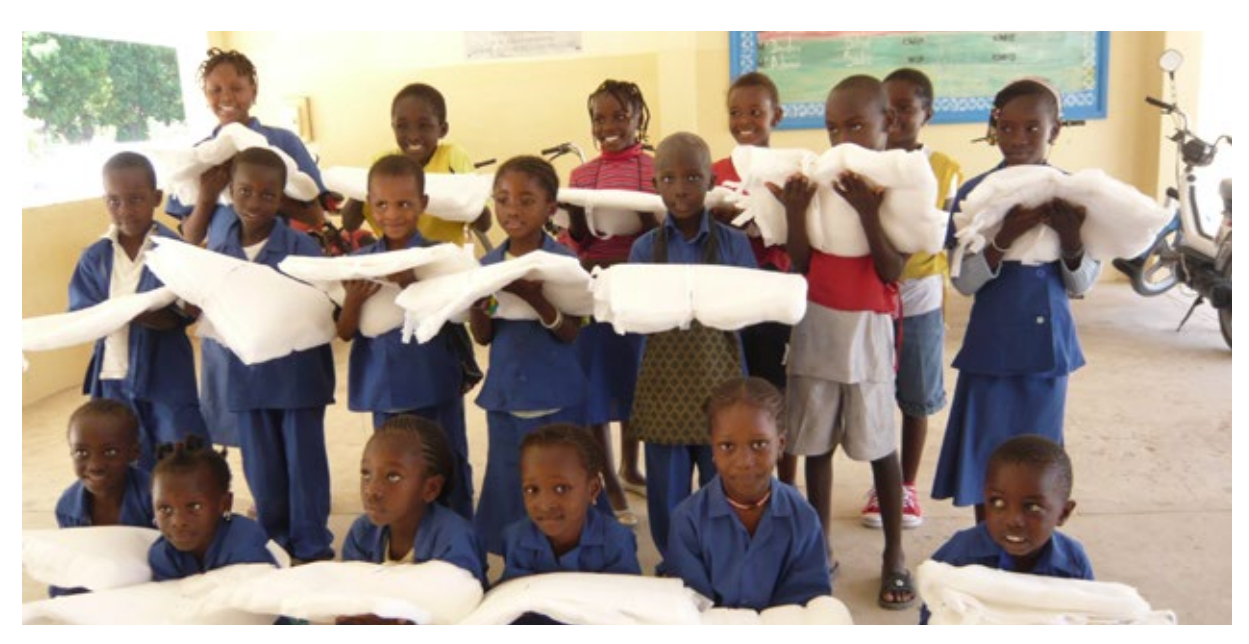
Pupils in a classroom in Ziguinchor, Senegal, display the LLINs they have received at school. (2013)