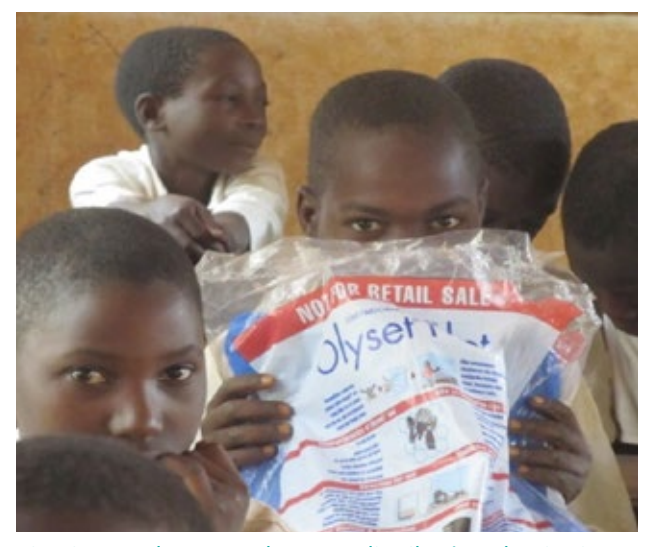
Nigerian students on the LLIN distribution day in Cross River state. (2013)

Use of print materials varied from country to country; materials were primarily used as aides for teachers. Simple and short frequently asked questions laminated cards were reported to be extremely useful. Ghana and Nigeria had a more elaborate teachers' guide, including a range of activities teachers could include in assemblies, class lessons and during distribution itself. Nigeria created a "malaria protection pledge," taught in class and reinforced with a wall poster, where students promised to use a net every night and encourage others to do the same. Other programs gave paper leaflets to children with each net. Programs that did include print materials felt that they played a useful role and plan to continue using them in the future. Careful evaluation of the cost benefit linked to rates of use, care practices or retention of LLINs may be useful given the fairly high cost of print materials.