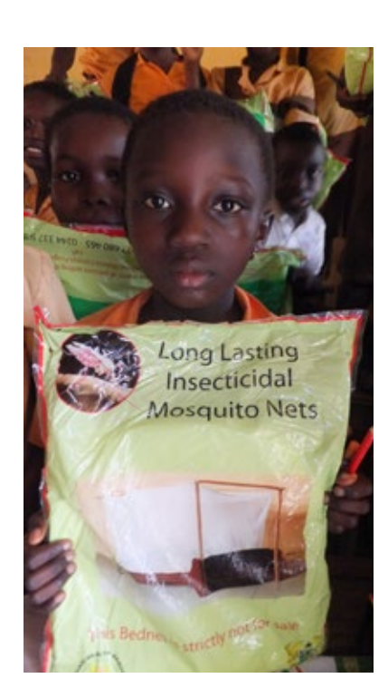
A pupil in Ghana holds the LLIN he received in school that day. (2014)